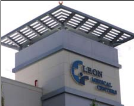
Aluminum Composite Material (ACM Panels)