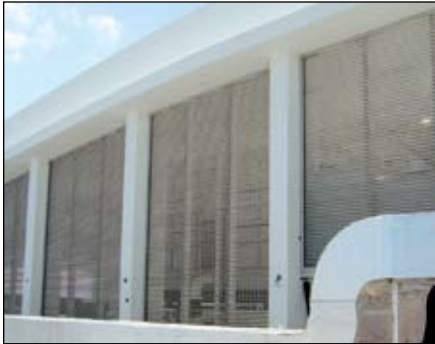
Screen (Visi-Screen, Bar Screen, I-Bar Screen, Wire Mesh & Modular Grid Panels)

Our structural systems can take many forms and shapes using one or more of these material types.