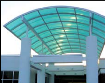
Polycarbonate & Acrylic Panels