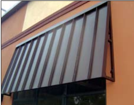
Standing Seam (Aluminum & Steel)