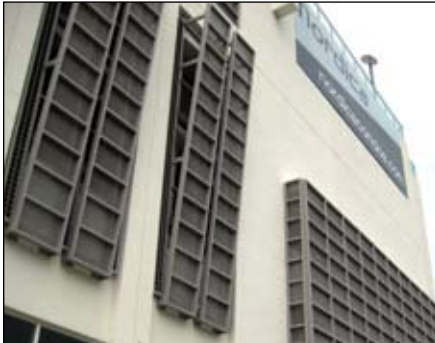
Perforated Metals (Aluminum & Steel)