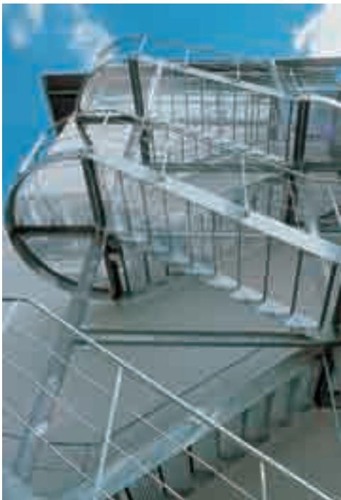
Fire escape for an industrial building